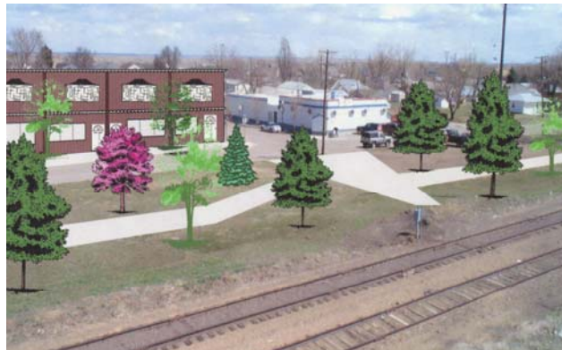
Proposed Eastlake Linear Park.

In order to offer an upgraded level of service to residents, employees and visitors to the Eastlake Subarea, additional parks, open space and trails improvements are needed. The proposed parks and trail improvements are intended to contribute to the vitality and community identity of the Eastlake Neighborhood. In addition, the recommendations for parks and trails included in this chapter seek to support planned transit improvements in the area.