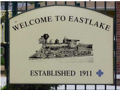
Posted at the pocket park on Third Street and Birch Avenue, this sign welcomes visitors to the Eastlake Historic Park.

At the time the Eastlake Master Plan was adopted by Thornton City Council in 1990, there were no public parks or recreational facilities located within Eastlake. The nearest park areas were Lake Village Park and Eastlake Park, both about a quarter mile away. The Eastlake Master Plan called for a series of park and trail improvements to provide recreational amenities to the residents of Eastlake and the surrounding area. Many of the improvements recommended in the Eastlake Master Plan have been implemented, including: