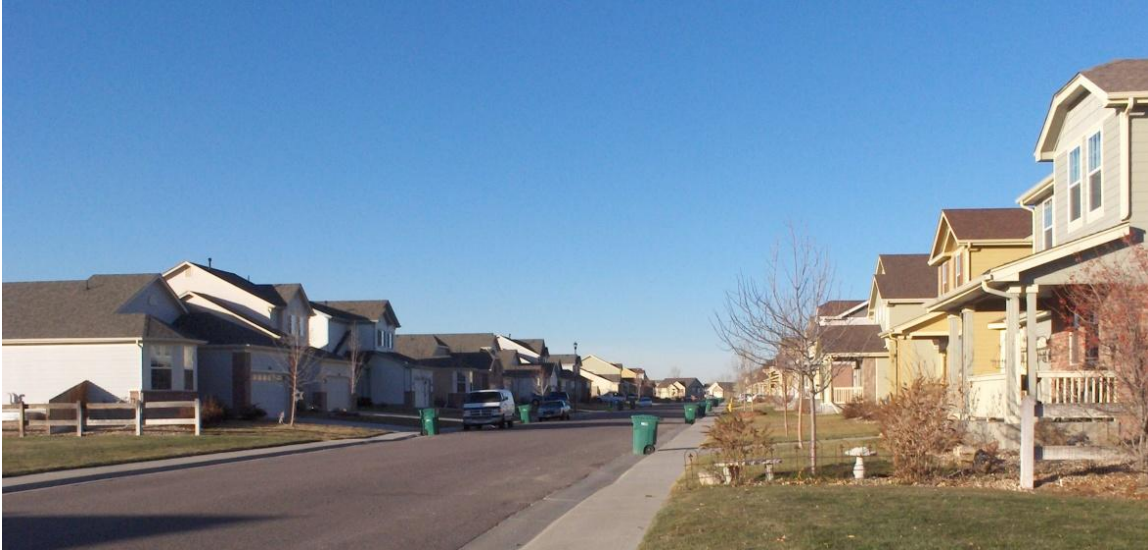
The different development phases of Skylake Ranch provide a side-by-side visual comparison of design quality in Thornton. The homes on the left side of the photo were built in the 1990s prior to the City's adoption of residential architectural design standards. The homes on the right side of the photo were built in accordance with the new requirements.

public recreation facilities; as well as detached sidewalks and quality entry and perimeter treatments, are evident results of the subdivision quality enhancement standards.