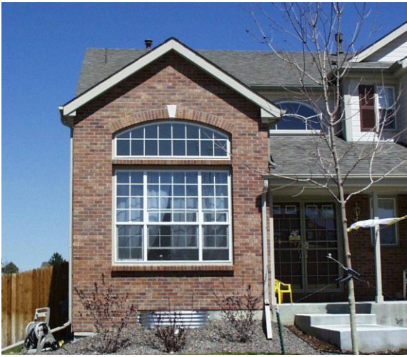
The City's current architectural standards encourage at least a portion of new homes to be covered in masonry.

Noticeable differences define the phases of residential development in Thornton. The 1950s and 1960s "Original Thornton" neighborhoods are comprised of post-World War II suburban ranch homes, typically having carports instead of garages, curvilinear streets, and cul-de-sacs. The 1970s gave way to larger homes with front facades dominated by garages. Many of the homes from the 1970s through the late 1990s reflect the City's lax architectural guidelines at the time. This is evident in the lack of design detail in façade materials, window placement, garage setbacks, and rooflines; as well as repetition of identical home models. Additionally, the