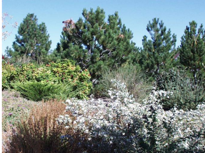
Xeriscaping, shown here at the Margaret Carpenter Recreation Center in Thornton, is an attractive, low-maintenance landscaping option that preserves natural resources.

In recognition of Colorado's semi-arid climate and limited water availability, the City currently requires all developers to use water-wise landscaping. However, the City does not currently mandate the same principles for homeowners. The City should be proactive in educating and encouraging homeowners to use water-wise landscaping to improve the appearance of yards and promote the efficient use of resources. Thornton Forestry, a Division of the Community Services Department, provides advice to residents concerning their landscaping and plant selection. The City's website provides a phone number to contact Forestry staff; however, it does not provide direct information about water-wise and xeriscape options. A summary, or web-links, describing these principles and options could be made available on the City's website.