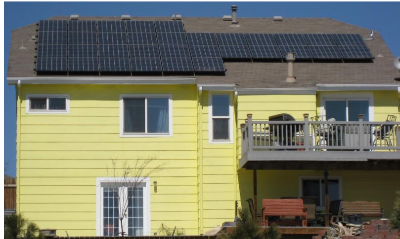
This Thornton home is utilizing solar panels as an alternative source of energy.

These improvements can make the home healthier and safer; increase comfort; conserve electricity, gas and water resulting in lower utility bills; and enhance home value. The City should encourage residents to have a home energy audit performed. The auditor can evaluate the function,