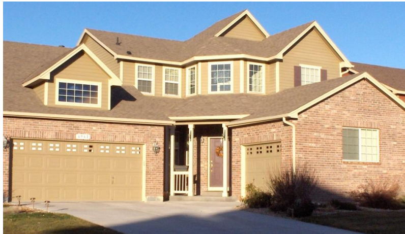
Better architectural standards have greatly improved neighborhood aesthetics and character.

architectural design elements such as high-quality front façade materials including brick or masonry, increased window area on the front façade, regulated roof pitches and color, garage offsets, and front porches. Additionally, each development incorporates a mixture of at least four different home models whose