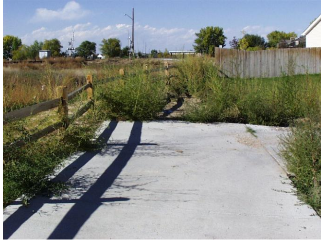
Realization of the goals of the Parks and Open Space Master Plan will help to prevent non-continuous trails, like this one in Eastlake Estates.

be considered and integrated with the design of residential development. Therefore, the Parks and Open Space Master Plan and the Housing Master Plan will act in concert to maintain and enhance Thornton neighborhoods.