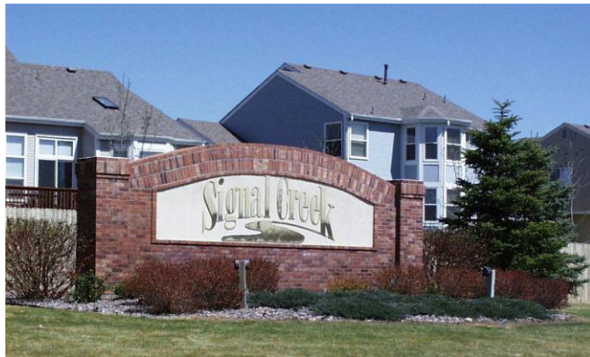
Subdivision standards promote neighborhood identity through high-quality entry treatments.

Development in Thornton has taken place in phases and under varying regulatory constraints, resulting in inconsistent design throughout the City. Since incorporation in 1956, City Council has periodically adopted higher standards for residential and commercial development in the City. Older residential development lacks any dominant or defining architectural or design theme, and therefore some of Thornton's older homes and subdivisions reflect only minimum standards of aesthetics and design. In October 1999, in an effort to improve the quality of residential units and preserve property values, City Council adopted two City Code revisions. The first revision established design standards for residential development and changed the development process to require architectural review approval prior to application for a building permit. The second revision established subdivision design criteria for private lots and public improvements, such as streets, drainage, water, wastewater, public utilities, and parks and recreation facilities.