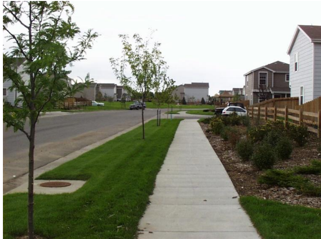
Detached sidewalks provide pedestrians with a pleasant path at a safe distance from vehicular traffic.

Since neighborhood design and transportation conditions affect the ability of residents to access community amenities, both inside and outside of the neighborhood, they also affect the quality of life and long-term desirability of the neighborhood. Neighborhoods that have a lot of walkers and cyclists on the street are safer because these residents have their "eyes on the street", deterring theft or violence. Safe, accessible and pleasant sidewalks and trails improve the health of the neighborhood and its ability to serve residents of all ages. There